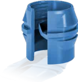
4006 / W101LX