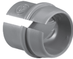
4004 / W100LX