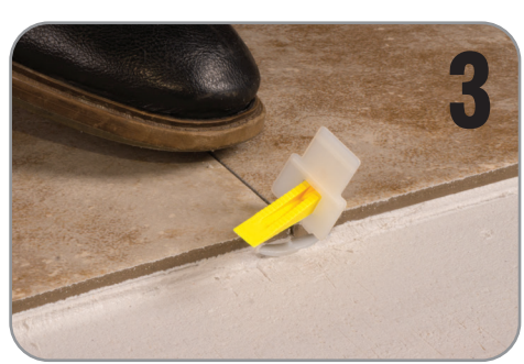
Once mortar has set, simply kick the clips to snap off at the specially designated break-points. Save wedges for future use.

The LASH system should only be used with a minimum 1/2" x 1/2" x 1/2" square trowel notch to apply the setting material. Back buttering your tile is always recommended.