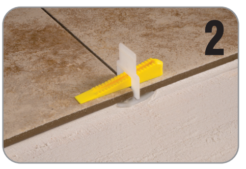
Slide the reusable wedges into the clips to LEVEL , ALIGN , SPACE and HOLD the tiles.