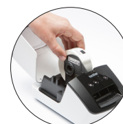
Convenient drop-in rolls let you switch label sizes in seconds