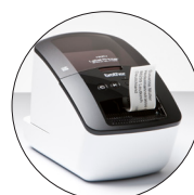
Print up to 93 labels per minute