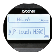
Brother™ Vivid Bright display for labelling in almost any environment