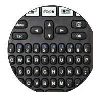
Large, Keyboard-style layout for easy and accurate typing