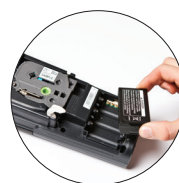
Rechargeable battery included