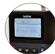
Brother™ Vivid Bright display for labelling in almost any environment