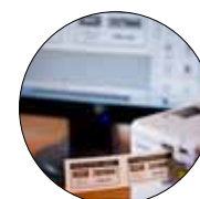
Includes P-touch Editor software: Easily create custom and barcode labels.