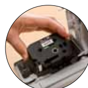
Drop-in tape cartridge design for easy cartridge replacement