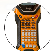
Rugged and durable with rubber impact guards