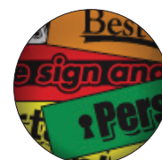
Built-in label collection feature: Over 50 pre-designed labels