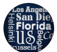
Select from 8 fonts, 10 type styles and 20 frames