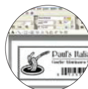
Create labels on your PC with included P-touch Editor software