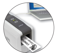
Compact and easy to carry, perfect for on the go labelling