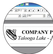
Fast Plug & Label™ technology. Easily make labels within seconds