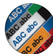
Organize and identify. Colourful labels to facilitate quick identification