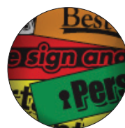
Built-in label collection feature: Over 50 pre-designed labels