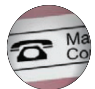
Get creative using customized labels with frames and symbols