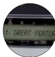
15-character LCD display.