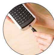
Save on batteries with optional AC adapter†