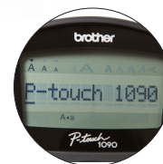
Large, easy-view display