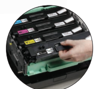
High-yield replacement toner cartridges available