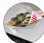
Automatic two-sided printing, copying and scanning