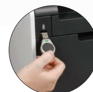
Direct print from and scan to your Flash USB interface