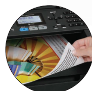
Automatic two-sided printing to save money and paper