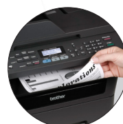
Automatic two-sided printing