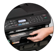
High-yield replacement toner cartridges available