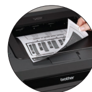
Automatic two-sided printing to save money and paper