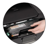
High-yield replacement toner cartridges available