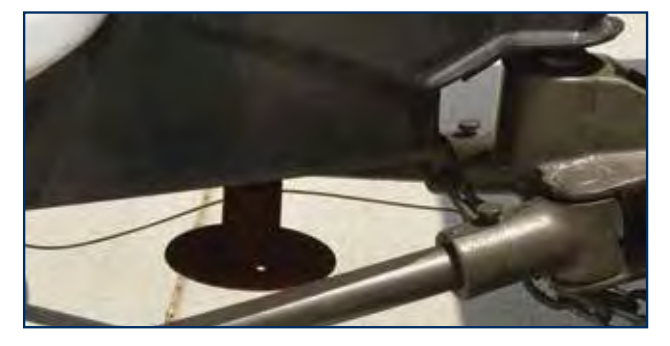
The Swaypro hitch comes with a Standard Hitch Head (BXW4011) fitting a Standard Coupler welded to the top of the trailer frame.

Does Your Trailer Have a Standard Coupler or an Underslung Coupler?