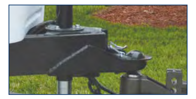
If your trailer has a coupler welded underneath the frame you will need to replace the hitch head with the Underslung Hitch Head (BXW4012)