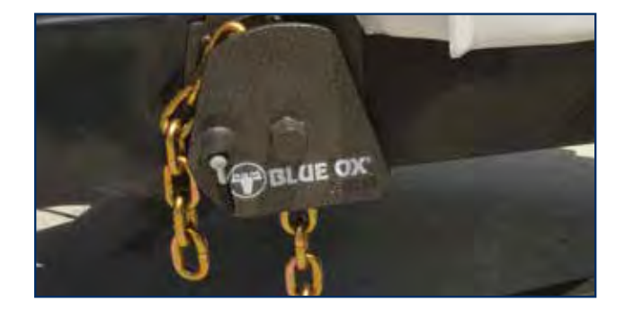
The Swaypro hitch comes standard with Clamp-On Latches (BXW4010). Designed for trailer tongue frames without cross members or equipment blocking attachment of the latches.