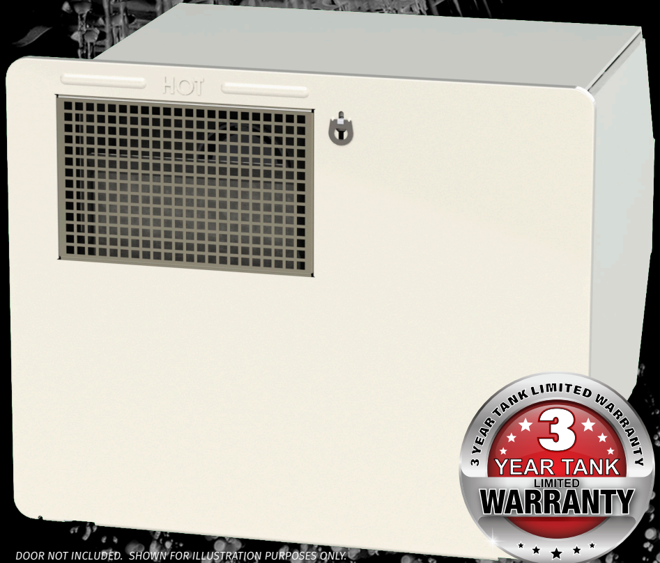
DOOR NOT INCLUDED. SHOWN FOR ILLUSTRATION PURPOSES ONLY.

Slows combustion process to transfer more heat to water in tank.