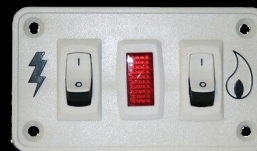
Domatic/Atwood Style Direct Spark Ignition with Electric Element Indoor Mounted Switch.

White: #234589 Black: #234229 Cream: #234795