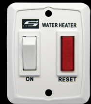
D, DE MODEL ON/OFF SWITCH

White: #232882 Black: #233111 Cream: #232881